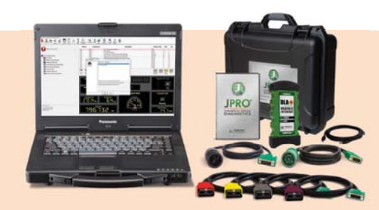
Fig. A | P/N: 263025-NS

+ Industry Compliance - All vehicle interface adapters and cables are compliant with the latest industry and regulatory standards and functionalities (i.e., RP1210C compliance, 3 CAN Channel compatibility, etc.)